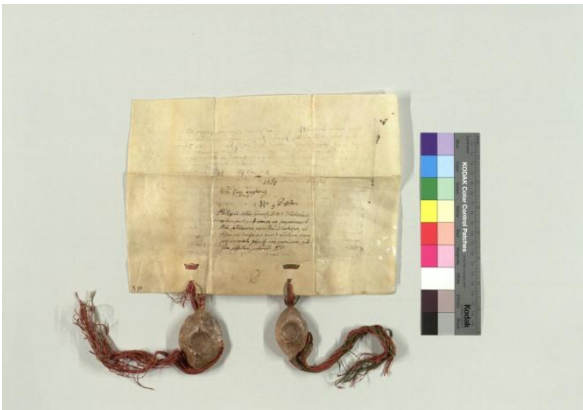
Example 6 - "NA-RM_13140827_1702_v.TIF"