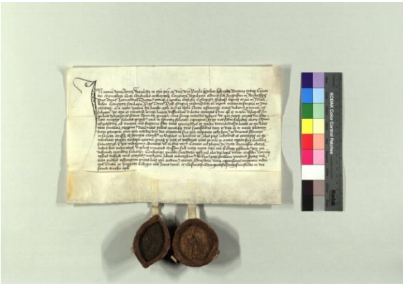
Example 3 - "StAR_14620921_1006_r.TIF"