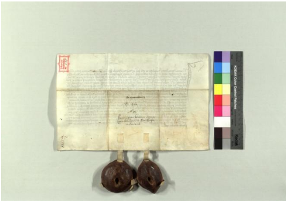
Example 4 - "StAR_14620921_1006_v.TIF"