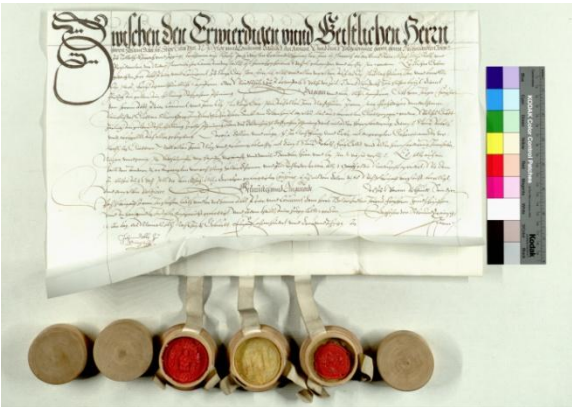
Example 1 - "StAK_15830727_r.TIF"