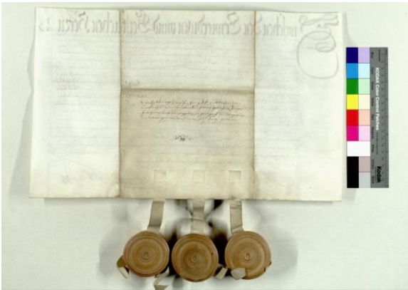
Example 2 - "StAK_15830727_v.TIF"